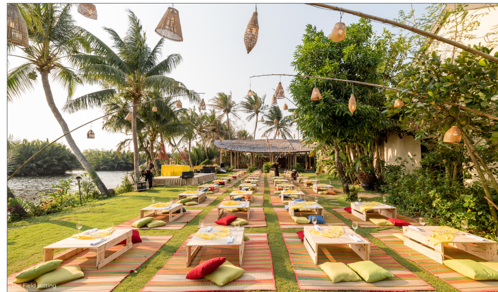
The Field setting