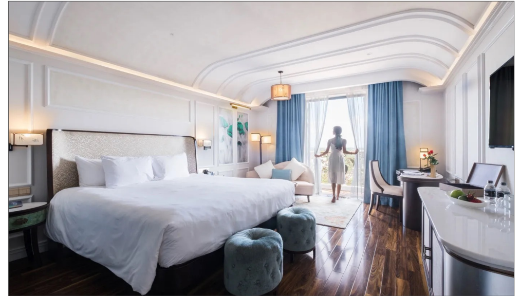
HOTEL ROYAL, M GALLERY, HOI AN HOI AN