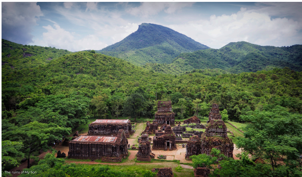
The ruins of My Son