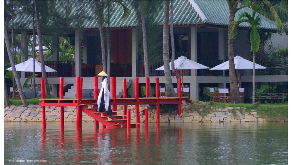
Red Bridge from riverside