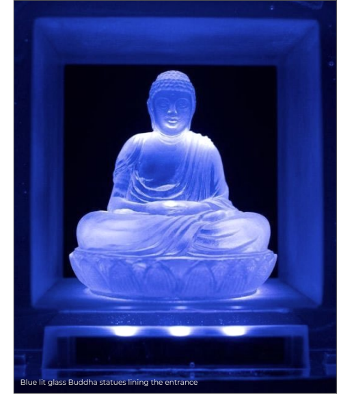
Blue lit glass Buddha statues lining the entrance