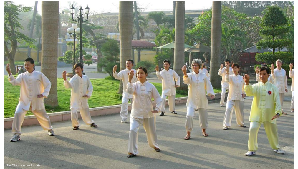
Tai Chi class in Hoi An