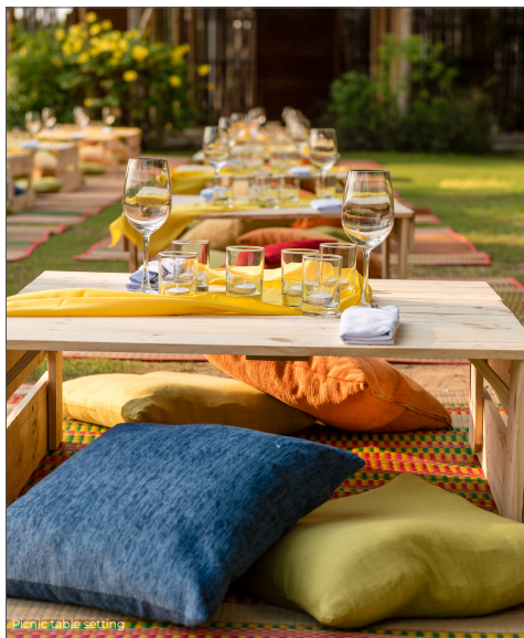
Picnic table setting