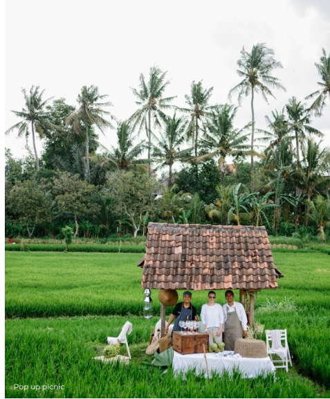
Pop up picnic