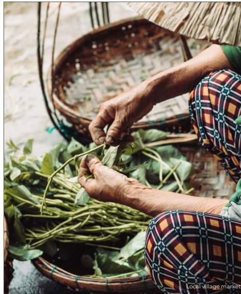
Local Village market