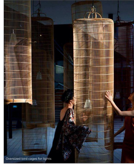
Oversized bird cages for lights