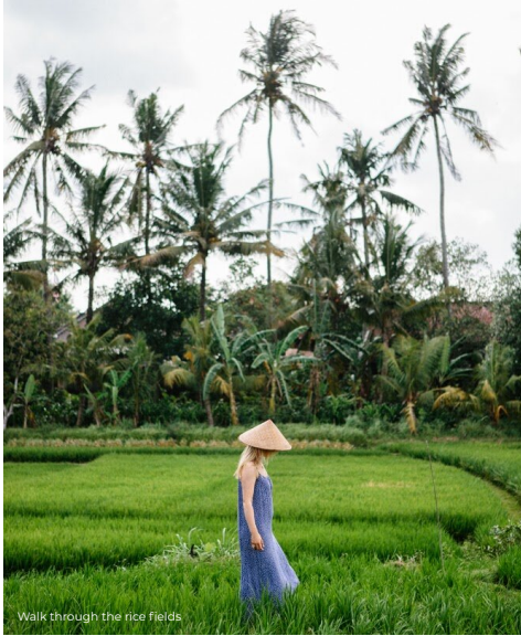
Walk through the rice fields