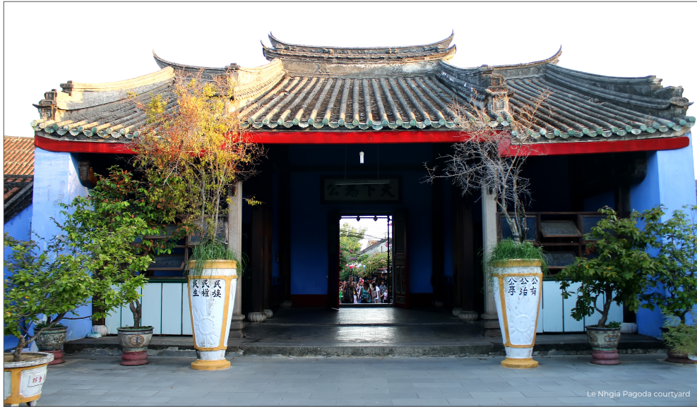
Le Nghia Pagoda courtyard