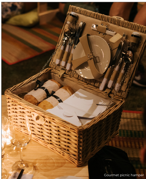
Gourmet picnic hamper