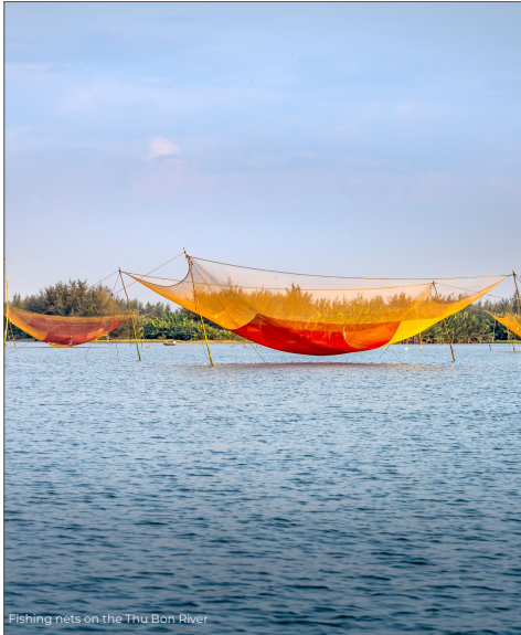
Fishing nets on the Thu Bon River