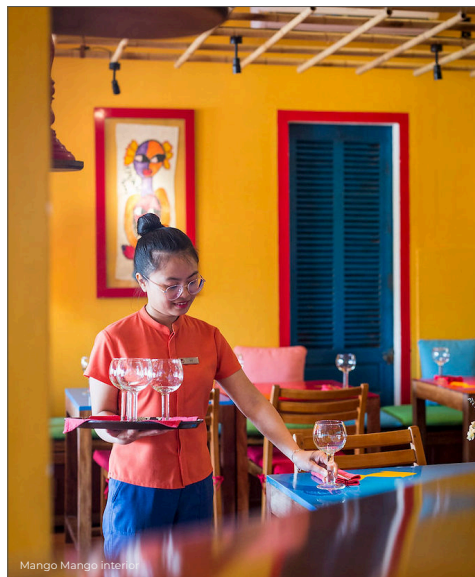
Mango Mango interior