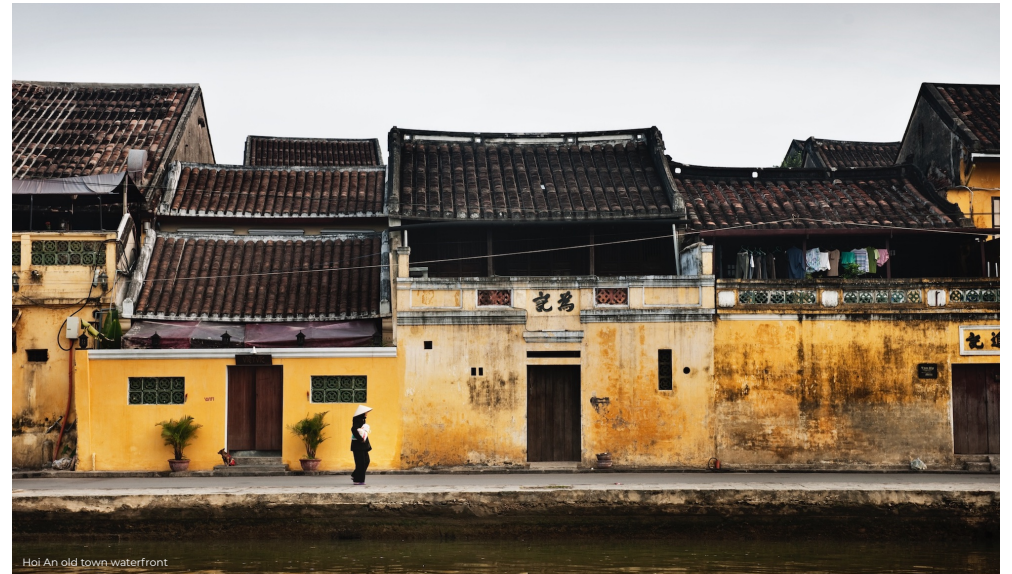
Hoi An old town-waterfront