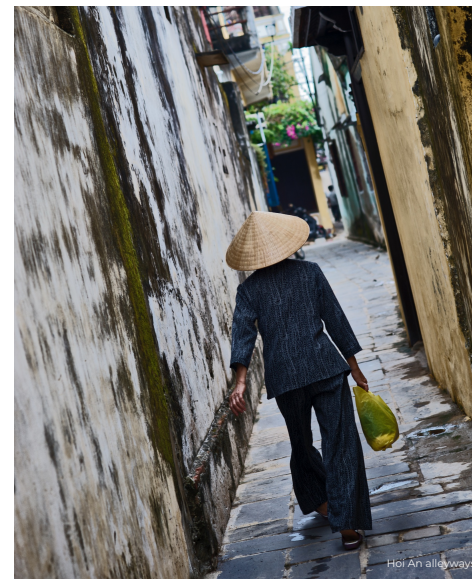
Hoi An alleysways