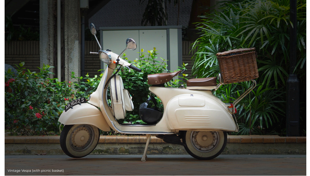
Vintage Vespa (with picnic basket)