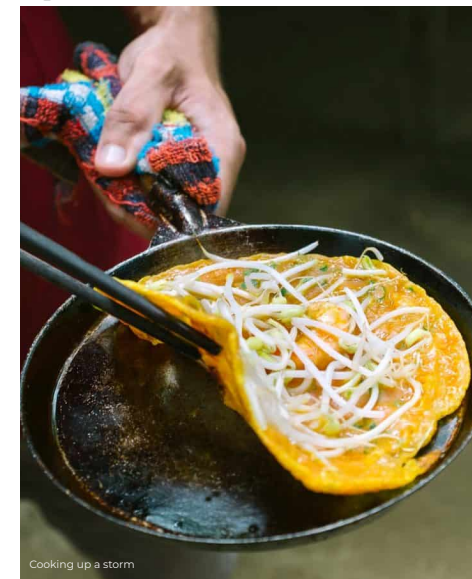
Cooking up a storm