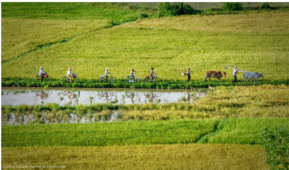
Cycling through the Hoi An countryside