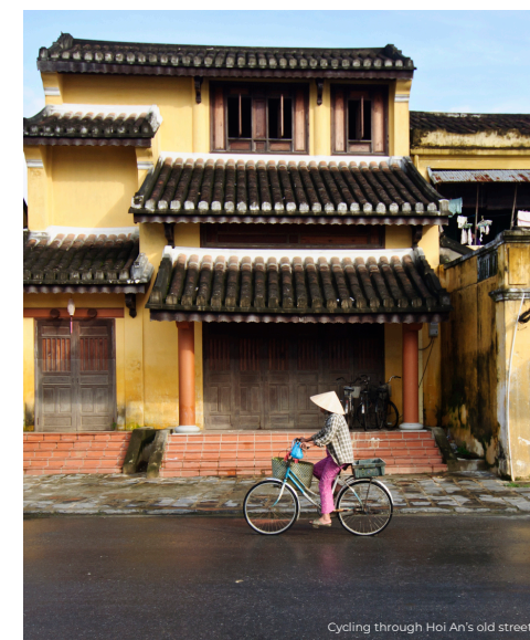
Cycling through Hoi An's old streets

After our sumptuous snack we leave the bikes then return to the resort by vehicle. For those that wish to stay on in town they are free to do so. Taxi cabs are in plentiful supply for those that wish to make their own way back at a time of their choosing.