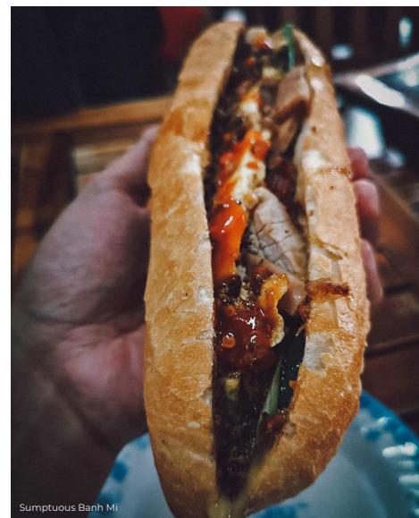
Sumptuous Banh Mi